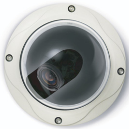
Wall Mount Application