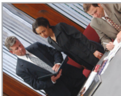
Tilted View with 2-Axis Bracket