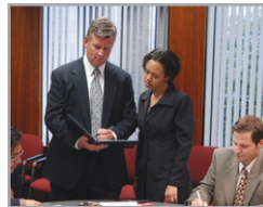
Perfect View with 3-Axis Gimbal Bracket